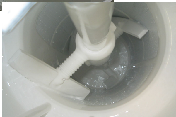
Inside view of the filter while scraping.